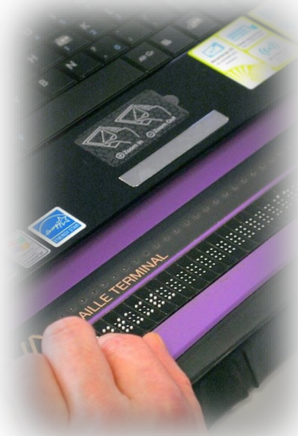
Image Braille keyboard Wikipedia