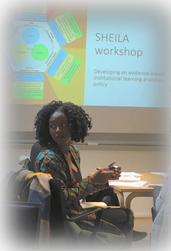
Image EUNIS SHEILA workshop, Helsinki