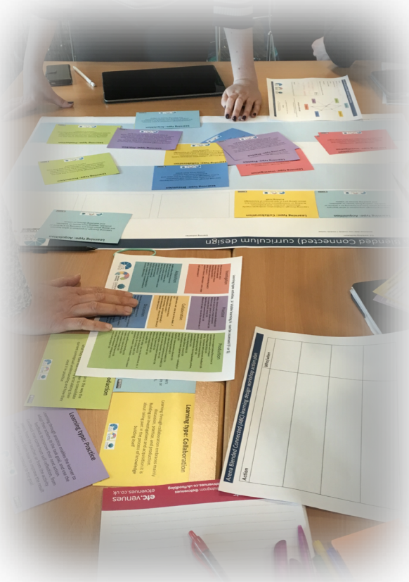
Image ABC learning design workshop